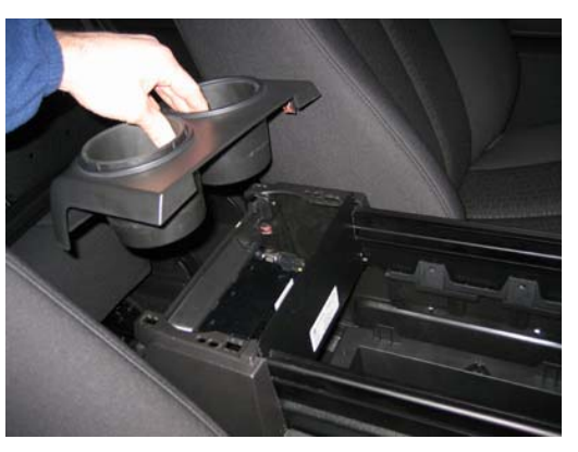
Replace rear cup holders